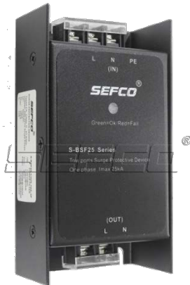
S-BSF25-1/320-5A , 10A